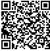
Waterloo Housing Group