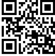
A C Lloyd Homes Ltd