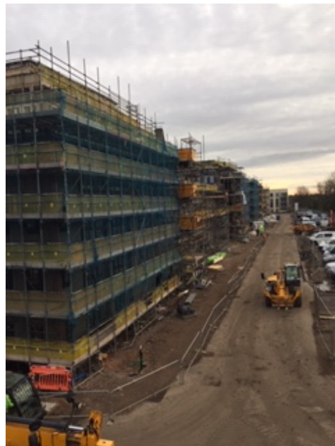
Looking down Phase 2